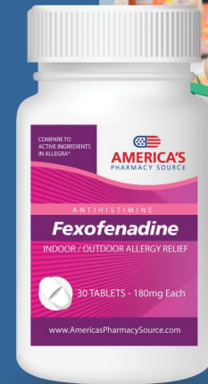
Fexofenadine (Allegra®) 180mg / 30 Count