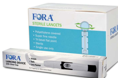
Lancing Device and Lancets